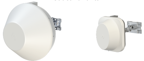
35cm size w/ 60GHz + 5GHz