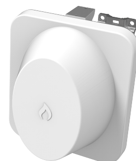
19cm Size w/ 60GHz + 5GHz