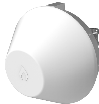
35cm Size w/ 60GHz + 5GHz